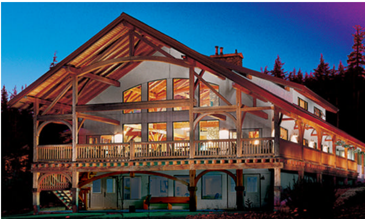
Heather Mountain Lodge

An information package will be sent to you after your registration.