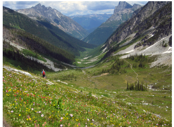
Balu Pass