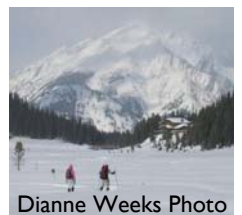
Dianne Weeks Photo